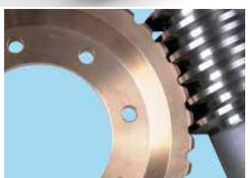
All our winches feature hardened and ground worms and bronze worm wheels for long service and reliability.