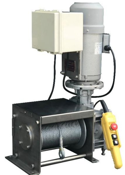
G&W 3500 WINCH (THIS MODEL IS CONSTRUCTED IN 316 STAINLESS STEEL)

Email: admin@winch.com.au Website: www.winch.com.au