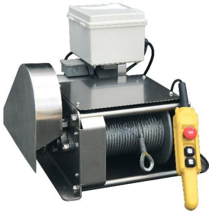
AM1026B SS WINCH (THIS MODEL IS CONSTRUCTED IN 316 STAINLESS STEEL)

This heavy-duty model boasts all solid steel construction with precision hob cut gears. These features all contribute to a product range that is incredibly reliable, efficient, strong and durable. All models can be fitted with remote controls. Suitable for hauling up to 7000kg.