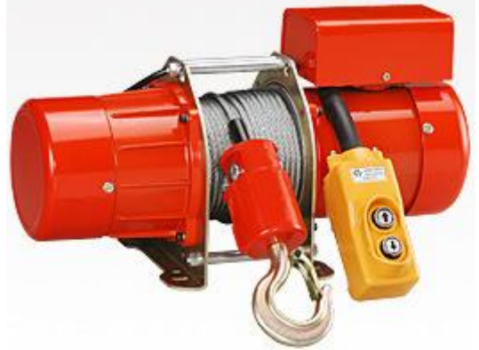
This winch features a precision machined, high efficiency gear train for long service and reliability.

For added safety and piece of mind, they are constructed with a fail safe electro magnetic disc brake which provides safe, easy load control. Tiger winches are extremely compact, user friendly and require minimal servicing.